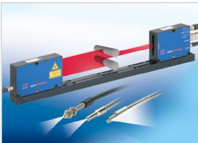
Optical micrometers and fiber optics, measuring and test amplifiers